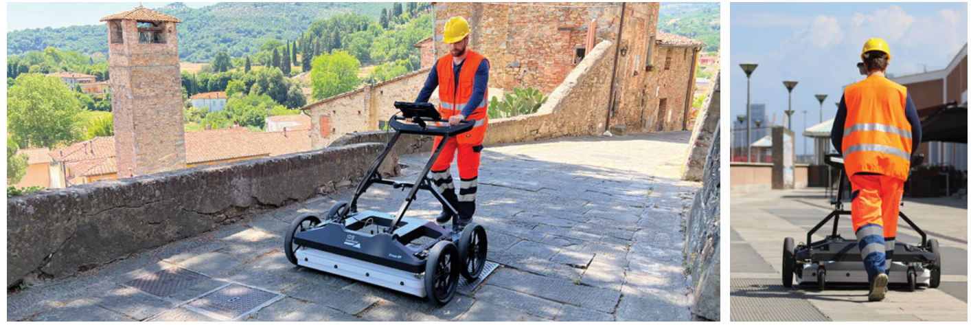
One solution for different scenarios: Stream DP is user-configurable in rugged (left) and asphalt (right) version.

With Stream DP, surveys are facilitated and successfully managed by one operator as the system can be effortlessly deployed, assembled and disassembled. Time and costs for safe data collection are significantly reduced as traditional downtimes and limitations are removed by Stream DP's versatility and improved efficiency in surveying.