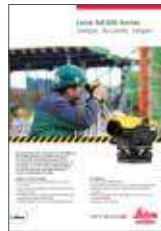
Leica NA300 Series Flyer

PROTECT is subject to Leica Geosystems' international manufacturer warranty and the general terms and conditions for PROTECT. For more information visit www.leica-geosystems.com/protect