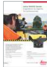
Leica NA500 Series Flyer