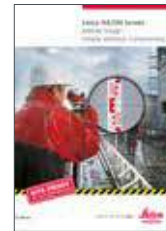
Leica NA700 Series Brochure