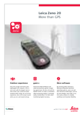
Leica Zeno 20 Datasheet

Other trademarks and trade names are those of their respective owners.