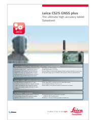
Leica CS25 GNSS Datasheet