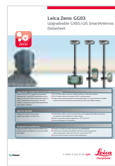
Leica Zeno GG03 Datasheet