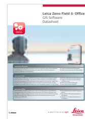
Leica Zeno Software Datasheet