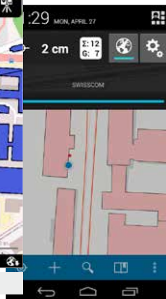
Zeno Connect (Android version)