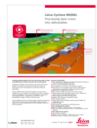
Leica Cyclone MODEL

Leica Geosystems AG Heinrich-Wild-Strasse 9435 Heerbrugg, Switzerland +41 71 727 31 31