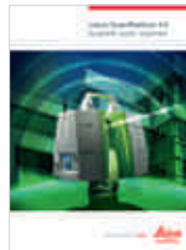
Leica Scanstation C5 Product information and specifications

Illustrations, descriptions and technical data are not binding. All rights reserved. Printed in Switzerland – Copyright Leica Geosystems AG, Heerbrugg, Switzerland, 2013. 795795en – 07.14 – galledia