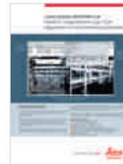
Leica Cyclone REGISTER Product information