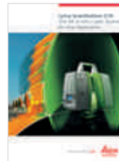
Leica Scanstation C10 Product information and specifications